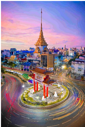
Discover Bangkok's best sights and local secrets.