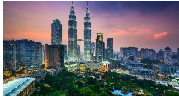
The captivating skyline and attractions of Kuala Lumpur

From the modern city of Singapore, explore Kuala Lumpur – a multicultural melting pot of cultures, contrasting modern and old architectures, untouched nature, rich traditions, popular cuisine and street food. Check out the world's tallest twin towers; or the newly launched TRX landmark building that is the new social heart of Malaysia; visit the ancient limestones of Batu Caves that features a beautiful Hindu temple; shop at the famous Central Market – a hub for Malaysian culture, arts and craft; or go on a street food hunt for some of the best local delicacies that is truly unique to the country and so much more!