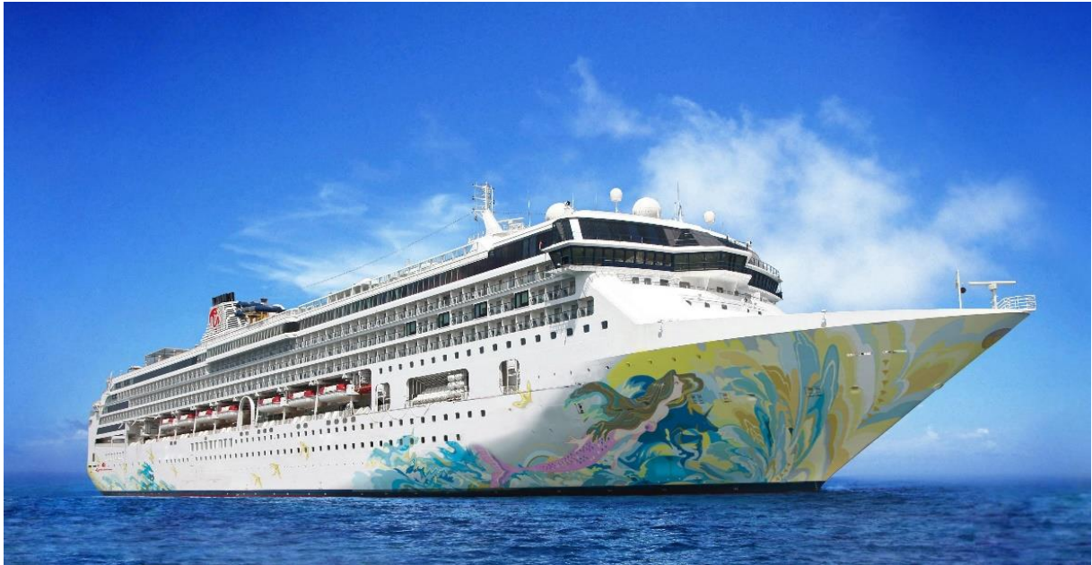
Resorts World Cruises deploys the Resorts World One cruise ship to homeport in Jakarta, Indonesia from 16 June – 1 July 2024.

Offering 6 Day / 5 Night cruises to Singapore and Kuala Lumpur from 16 June – 1 July 2024